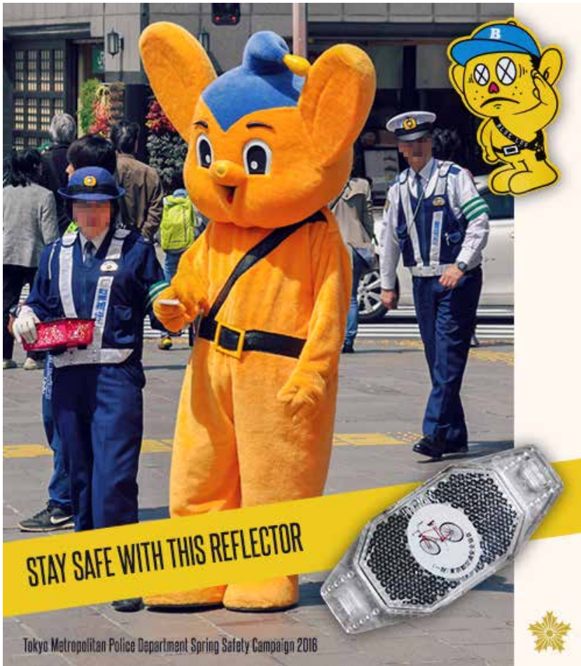
Tokyo Metropolitan Police Department Spring Safety Campaign 2016