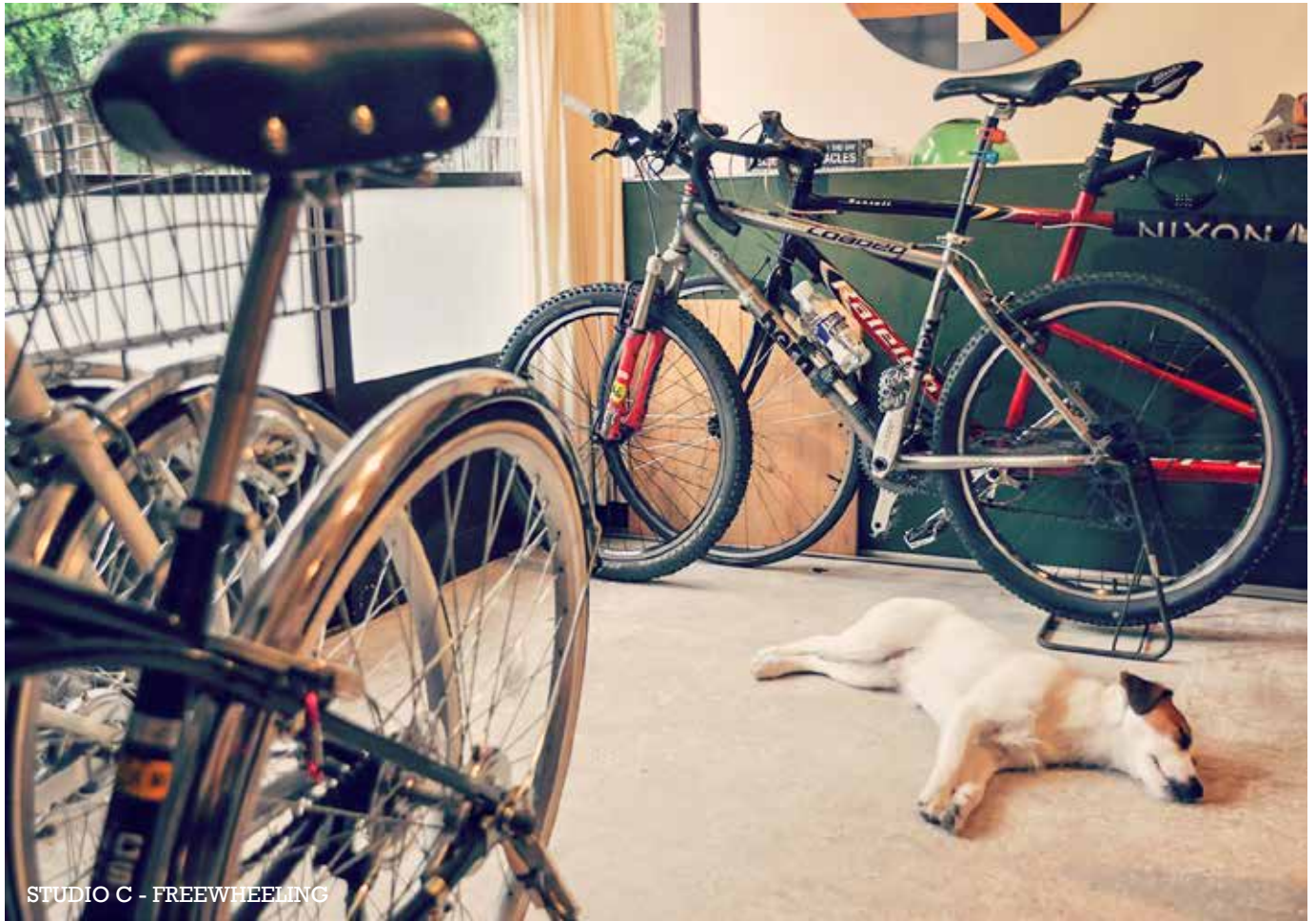
STUDIO C - FREEWHEELING